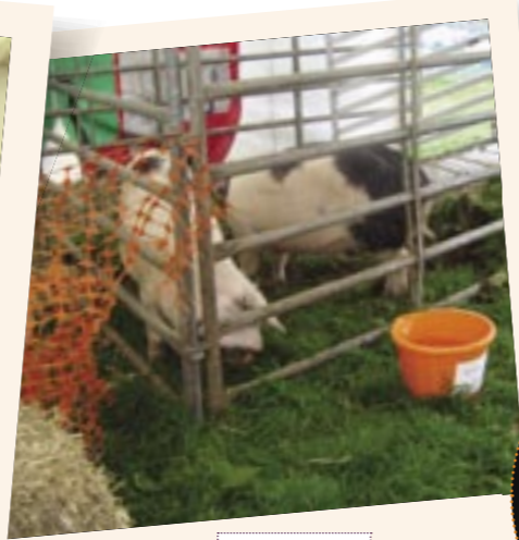
A CHANCE TO SEE FARM ANIMALS