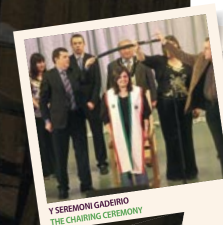
Y SEREMONI GADERIO THE CHAIRING CEREMONY

"The award ceremony at the Winter Fair, where I received the £800 prize money, generated a lot