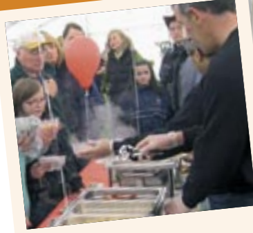
ALFE'S RESTAURANT OFFERS A TASTE OF THE COUNTRYSIDE

>> Log on to the NFYFC website for full details of this year's competitions and events schedule. Dates, rules, entry forms – everything you need to take part is available online at www.nfyfc.org.uk .