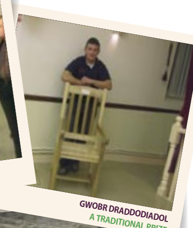
GWOBR DRADDODIADOL A TRADITIONAL PRIZE