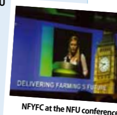
NFYFC at the NFU conference

More information about your YFC industry representatives is available online at www.nfyfc.org.uk/yfcindustryreps .